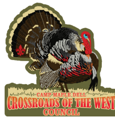
14" Wild Turkey Patch $25,000