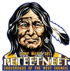
12" Peteetneet Patch $10,000