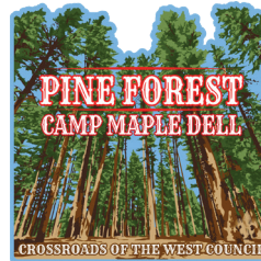
10" Pine Forest Patch $5,000