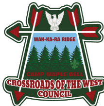
8" Wa-Ka-Ra Ridge Patch $1,000